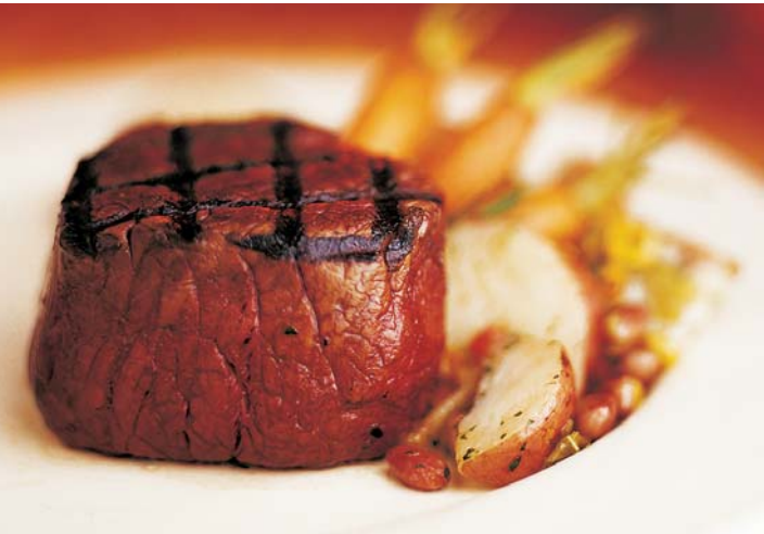
Tenderloin Filet served with roasted potatoes and vegetables, as served at The Fort Restaurant.

Specializing in breakfast, brunch, lunch, dinner and cocktail receptions, The Fort offers a variety of menu options with various price ranges. Groups of all sizes and all age groups enjoy coming to The Fort for an authentic 19th century experience. Dining at The Fort is more than a hearty meal...it is a step into the early west!