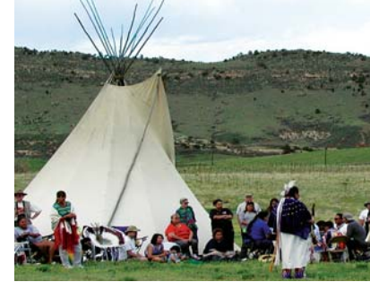
Dancers compete in a traditional Powwow dance at the Indian Market and Powwow.