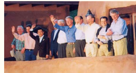
President Clinton hosting the Summit of the Eight, 1997