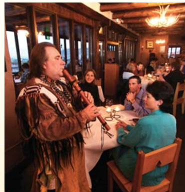
Diners enjoying Native American flute music