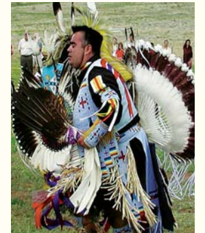
Native American in ceremonial dress.

Plan your excursions around these special Tesoro events! For more information on the Tesoro Foundation, visit www.tesorofoundation.org or call 303-839-1671.